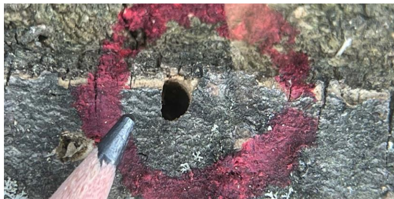
D-shaped emergence hole