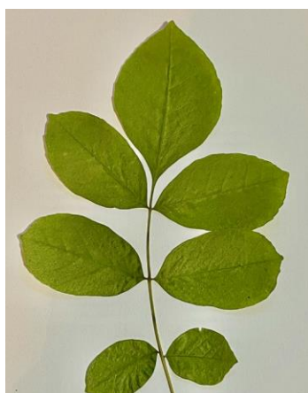
Oregon Ash leaf